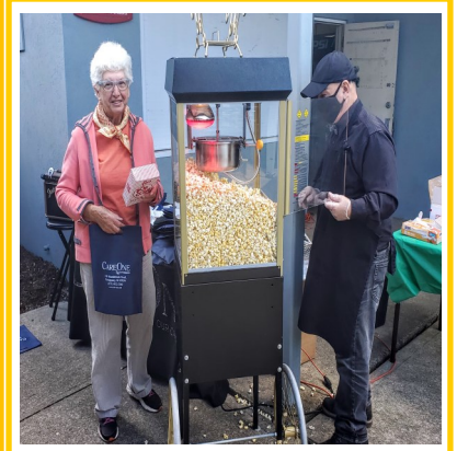
★ 2022 Fall Picnic ★