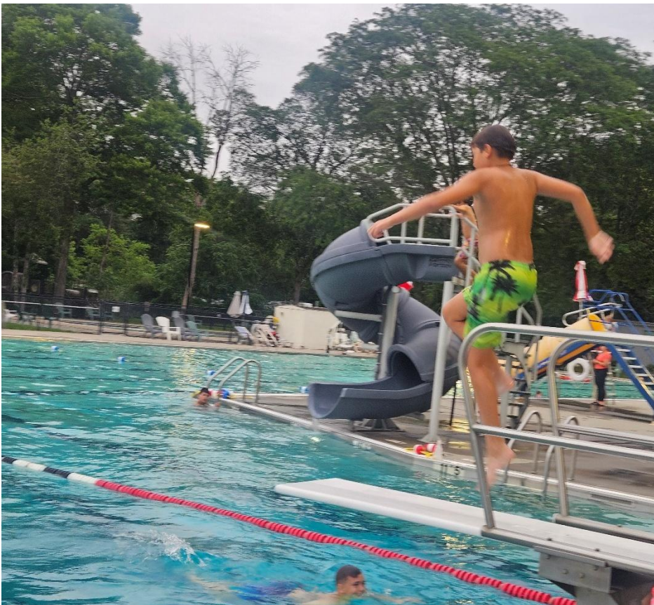
Who can make the biggest splash??