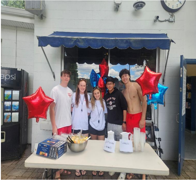
Memorial Day Weekend!